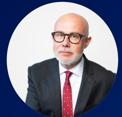
Moderated by: Piotr Kuś ENTSOG