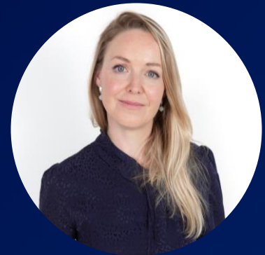
Moderated by: Carmel Carey ENTSOG