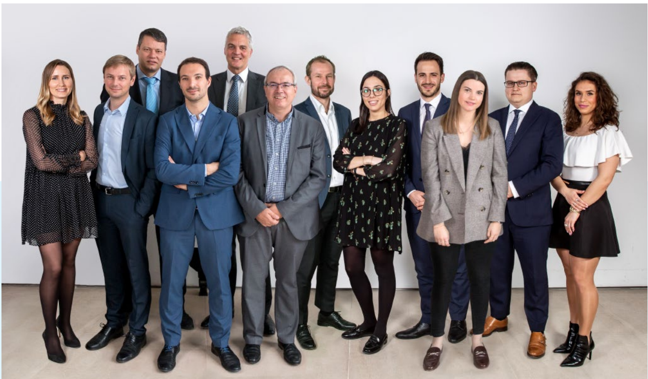
SYSTEM DEVELOPMENT TEAM

The candidate will focus on the collection of necessary data and EU-wide simulations of the gas infrastructure for Ten-Year Network Development Plan (TYNDP) security of supply simulations and Winter and Summer Outlooks as well as the development of ENTSOG maps and continued development of ENTSOG's Modelling work .