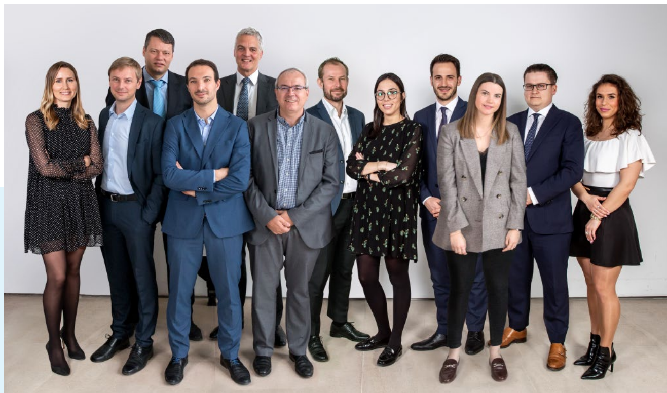
SYSTEM DEVELOPMENT TEAM

The candidate will focus on development of Ten-Year Network Development Plans (TYNDPs) and related methodologies, will provide support on PCI process led by European Commission and support TSOs on Gas Regional Investment Plans .